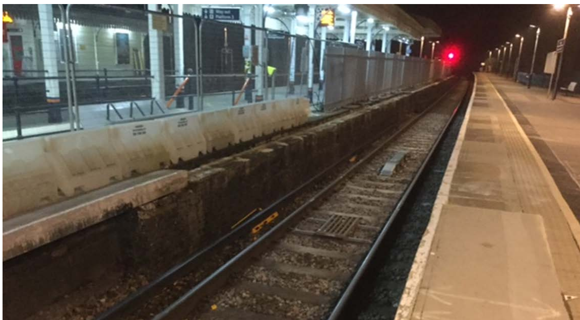
Platform 1 at Ascot station, where the work was taking place

At approximately 01:30 hrs on Friday 7 April 2017, two track workers narrowly avoided being struck by a train at Ascot station. They were working on a line that they mistakenly believed was blocked to trains. The track workers moved off the line less than three seconds before the arrival of the train. They were unhurt in the incident.